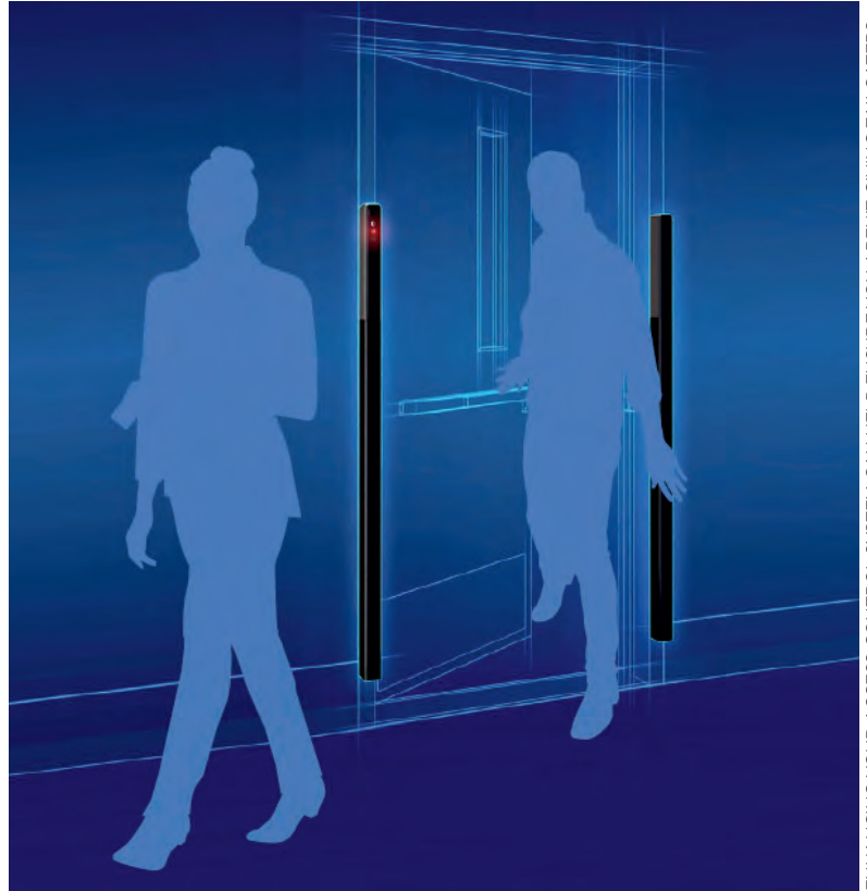
ENHANCING YOUR ACCESS CONTROL SYSTEM CAN HELP ENSURE YOU AREN'T GIVING TAILGATERS AN "ENTER FREE" PASS.

Panic hardware with delayed egress and latch retraction. An alarm will sound during the 15 second delay to alert staff to unauthorized entry before the door opens.