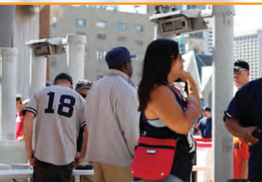
HI-PE Plus Multi Zone WTMD