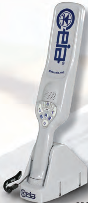
PD240 Hand-Held Detector